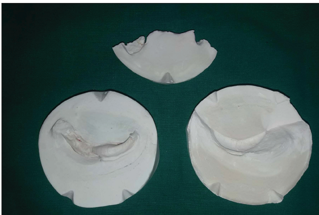
Figure 7: Three-piece mold