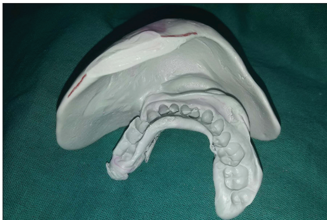
Figure 3: Combined intra- and extraoral secondary impression