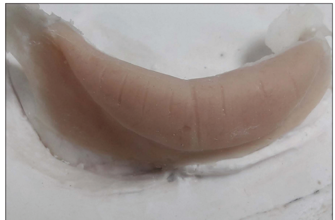
Figure 8: Retrieved prosthesis from the mold