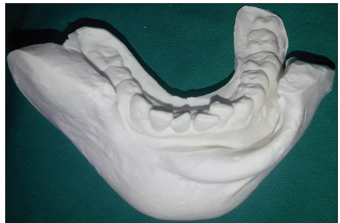
Figure 4: Model of lip defect