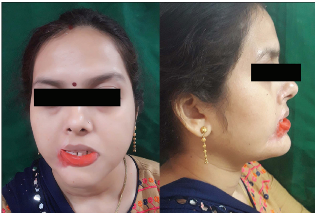
Figure 5: Pattern: frontal and profile views

Lip is a tactile organ which contributes not only to the process of articulation but also in creating oral seal. Its importance in attractiveness, identification of an individual,